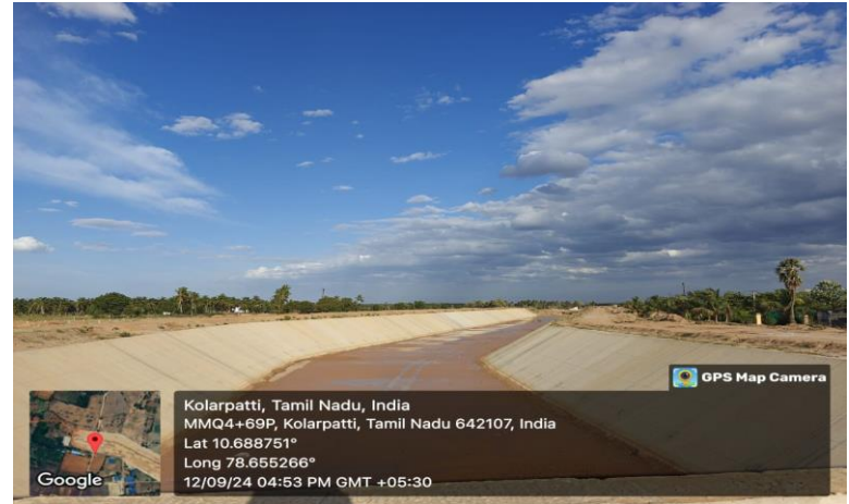
Canal lining – Reach -II