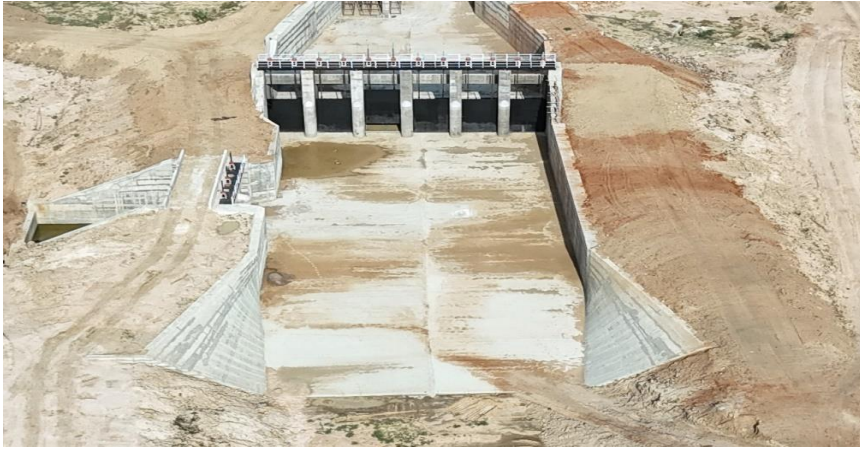
Cross regulator at LS 59.880 Km