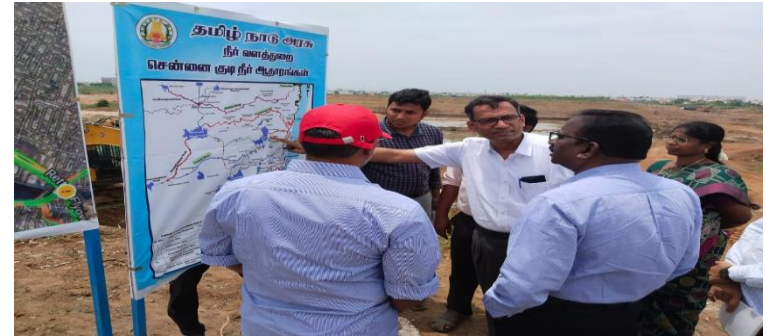
DURING ACS, WRD INSPECTION