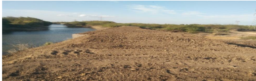
CONSTRUCTION OF PROTECTIVE WALL