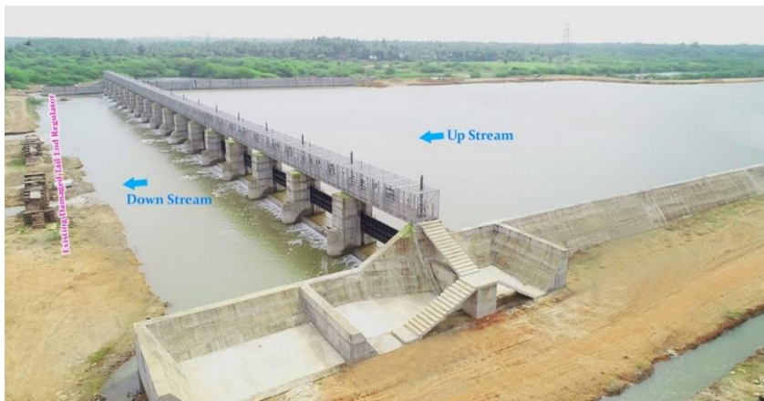
Kazhuveli Tail End Regulator