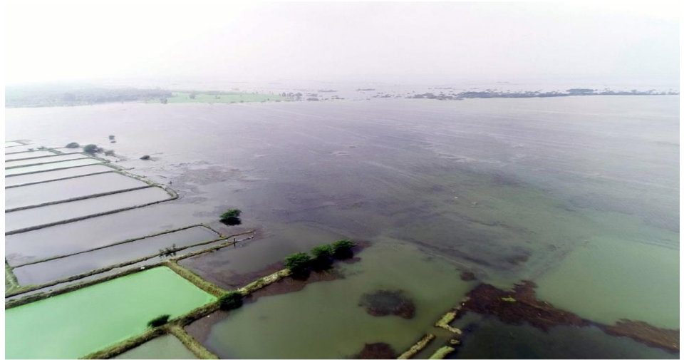
Kazhuveli Tank Water Spread Area at LS 16 Km