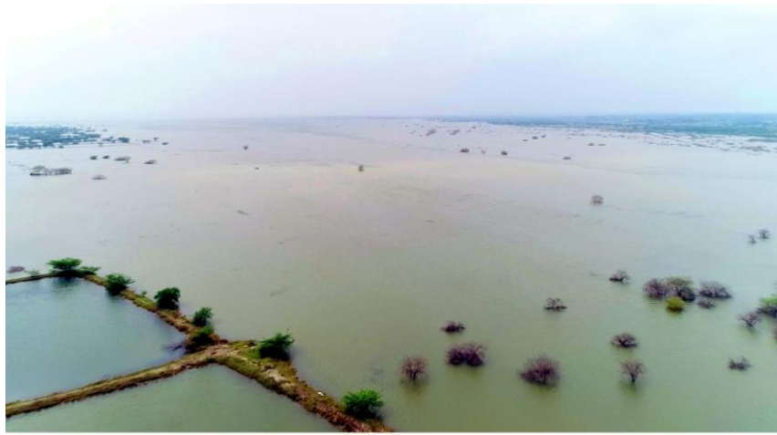
Kazhuveli Tank Water Spread Area at LS 12 Km