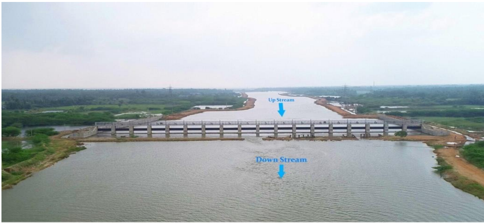
Kazhuveli Tail End Regulator