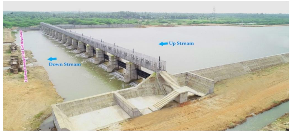
Kazhuveli Tail End Regulator