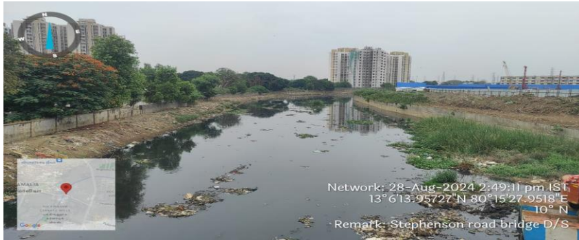
BEFORE EXECUTION Stephenson Bridge D/s

Removal of floating matters, vegetation, obstructions for free flow of water in Otteri Nullah Canal from LS 8065m to LS 9550m Ambedkar College Road Bridge in Chennai District.