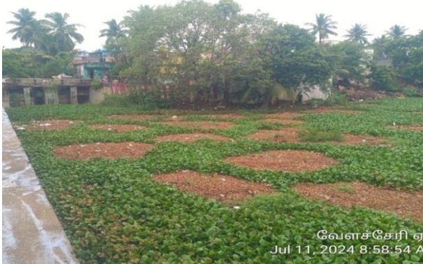
BEFORE EXECUTION 200 Feet Road