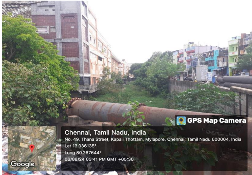
BEFORE EXECUTION Mylapore Railway Station

Removal of floating matters, vegetation and obstructions the removed materials in the Central Buckingham Canal from LS 3600m to 7200m in Chennai District.