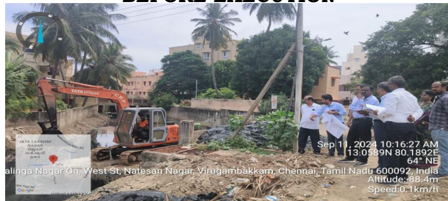
DURING ACS, WRD., INSPECTION