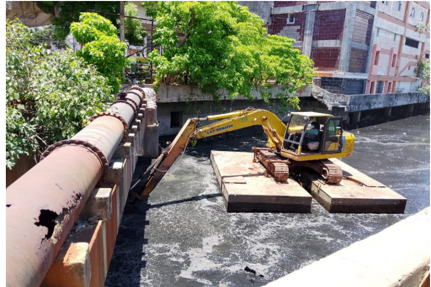
DURING EXECUTION Mylapore Railway Station