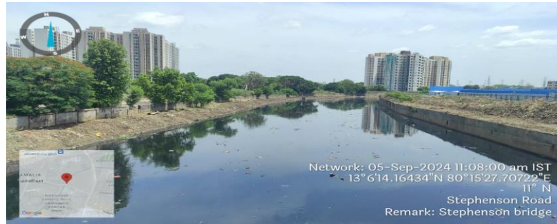
DURING EXECUTION Stephenson Bridge D/s