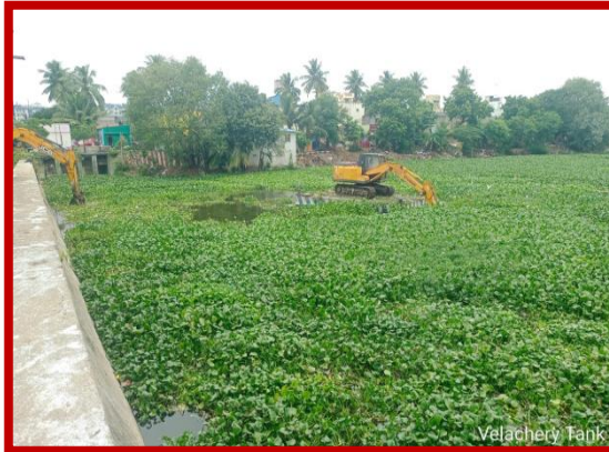
DURING EXECUTION 200 Feet Road