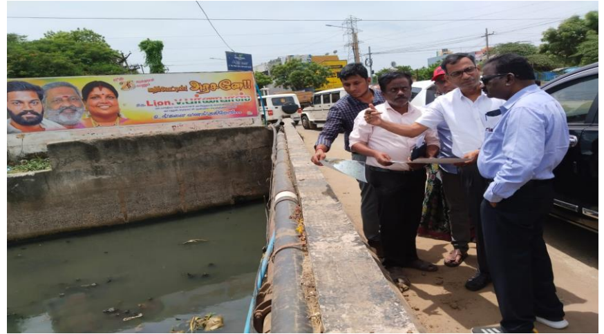
DURING ACS, WRD., INSPECTION