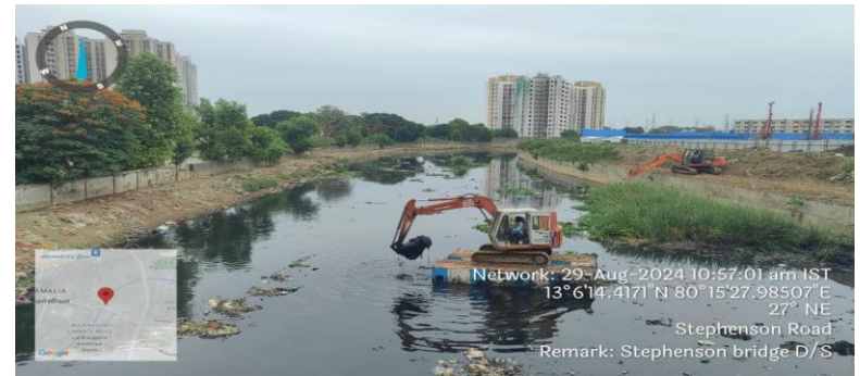
DURING EXECUTION Stephenson Bridge D/s