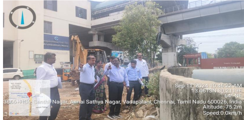
DURING ACS, WRD., INSPECTION